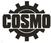
TABLE - 19